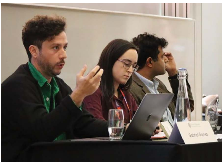
GNET 2024 Panel on Youth Radicalisation in Gaming Communities

is incredibly flexible and tailored to the evolving nature of your research. Don’t be afraid to pivot if necessary. Research landscapes, particularly in policy relevant areas, can shift rapidly and being agile can lead to more impactful outcomes. The application for funding is also a simple process. There is flexibility with what is needed dependent on the research environment. I thoroughly recommend applying for the fellowship and integrating appropriate engagement activities into your research plan.”