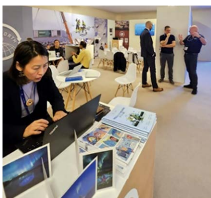
COP28: the United Nations Climate Change Conference in Dubai in 2023 where the comic was available for delegates